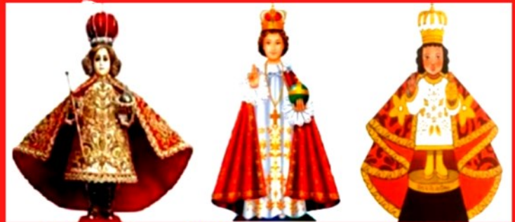
Sto. Niño de Tondo Manila, Philippines